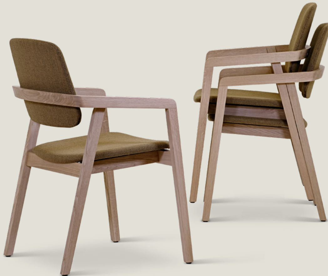
The Ayo Medium Chair in oak (clear oil).