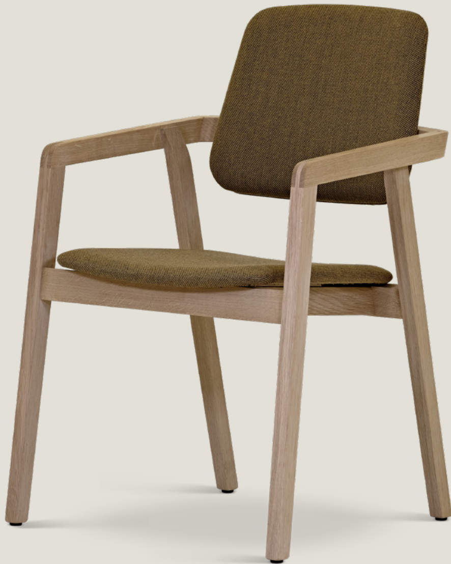
The Ayo Medium Chair in oak (clear oil).

The design presents a modern, inviting expression, while also being stackable, making it ideal for both healthcare facilities and other professional environments.