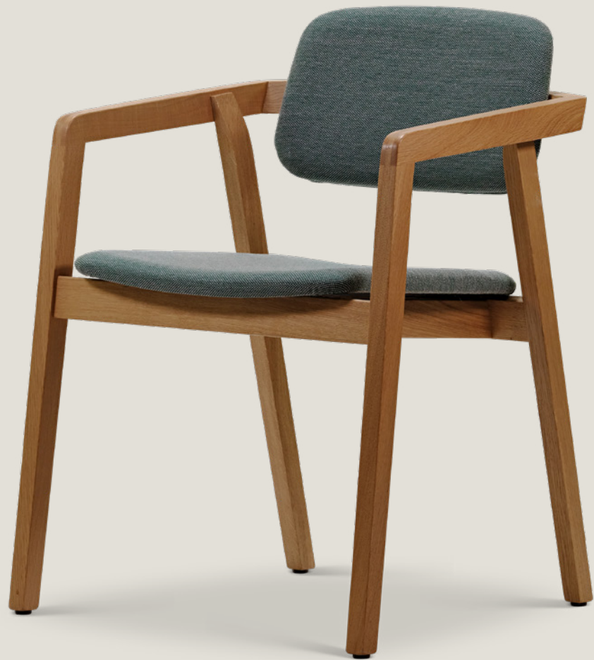
The Ayo Low Chair in oak (dark oil).