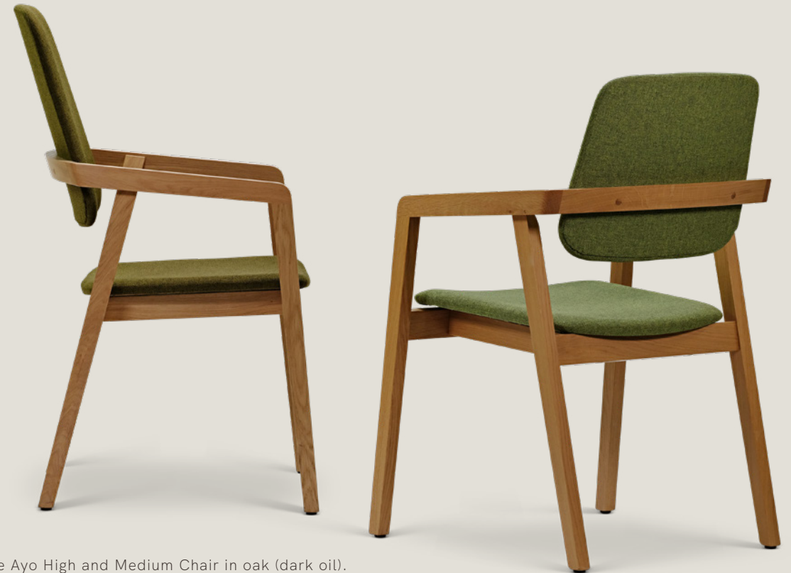
The Ayo High and Medium Chair in oak (dark oil).