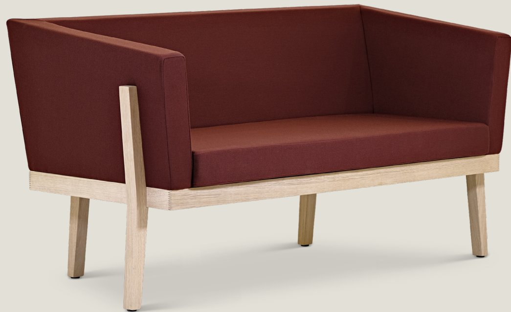
The Ito 2 Sofa in oak.