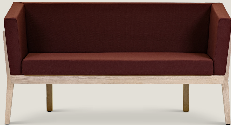
The Ito 2 Sofa in oak.