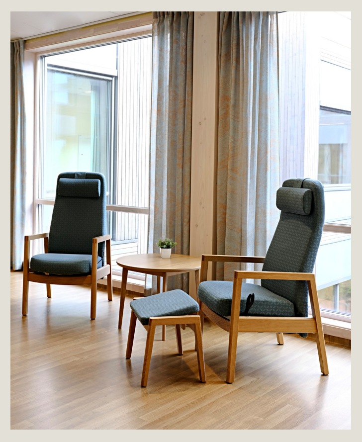
The Ono SV at the Nygård Nursing Home.

"We have selected Ono for Nygaard Nursing Home because we knew that by choosing this chair, we received a quality product, delivered safely and precisely, at the agreed time. The choice also fell on Ono because the chair has a simple design, which at the same time is really comfortable to sit in. The furniture is durable and made in a way where our staff do not have to tighten screws. It also matters to us that the chair is flexible in terms of additions and omissions."