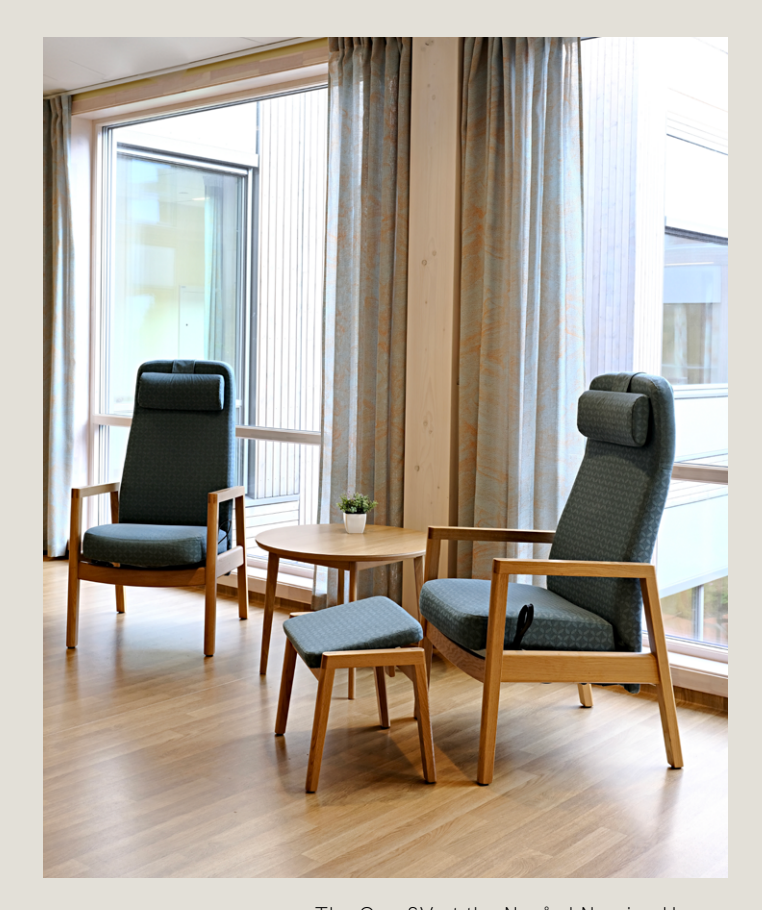
The Ono SV at the Nygård Nursing Home.

"We have selected Ono for Nygaard Nursing Home because we knew that by choosing this chair, we received a quality product, delivered safely and precisely, at the agreed time. The choice also fell on Ono because the chair has a simple design, which at the same time is really comfortable to sit in. The furniture is durable and made in a way where our staff do not have to tighten screws. It also matters to us that the chair is flexible in terms of additions and omissions."